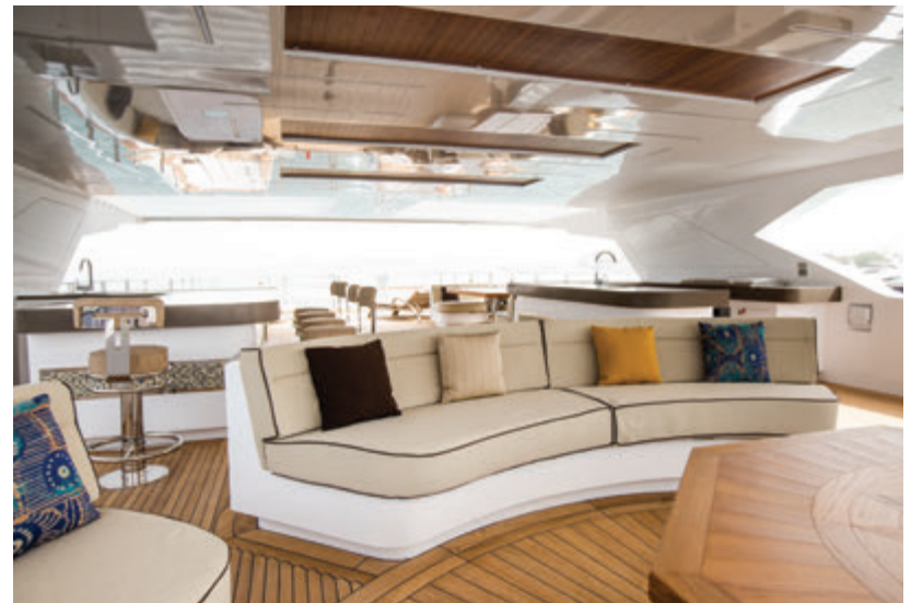
ABOVE CLOCKWISE Jacuzzi. Panoramic Saloon Sun Deck. Sun Deck