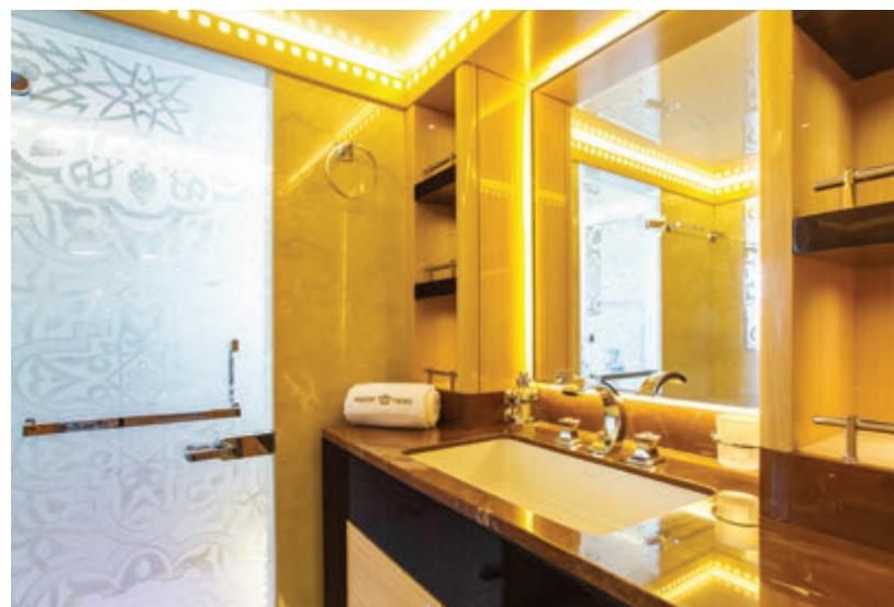
ABOVE CLOCKWISE Double Guest Stateroom. Double Guest En Suite Twin Guest Stateroom. Twin Guest En Suite