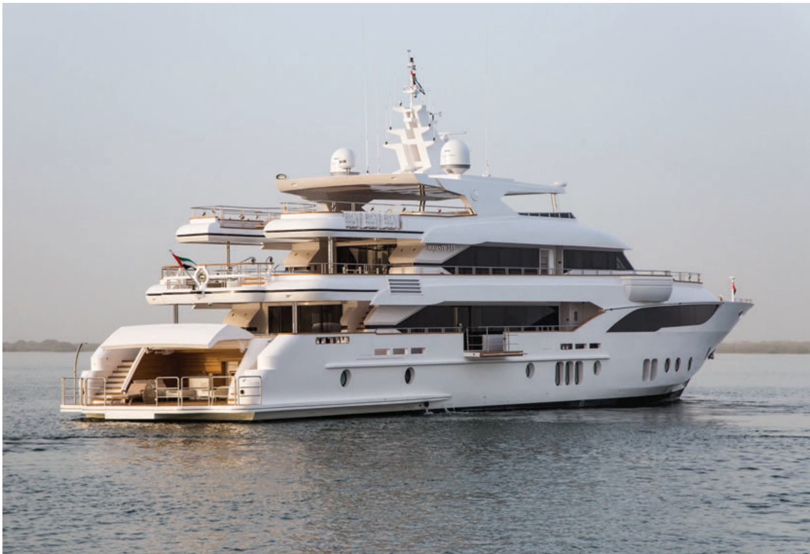
ABOVE Profile Umm Al Quwain, UAE