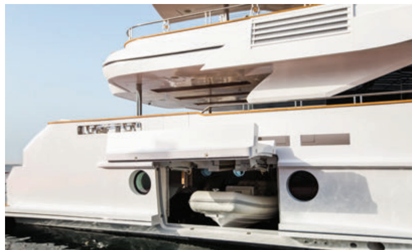
OPPOSITE Profile ABOVE CLOCKWISE During Sea Trial. Garage. Saloon Balcony