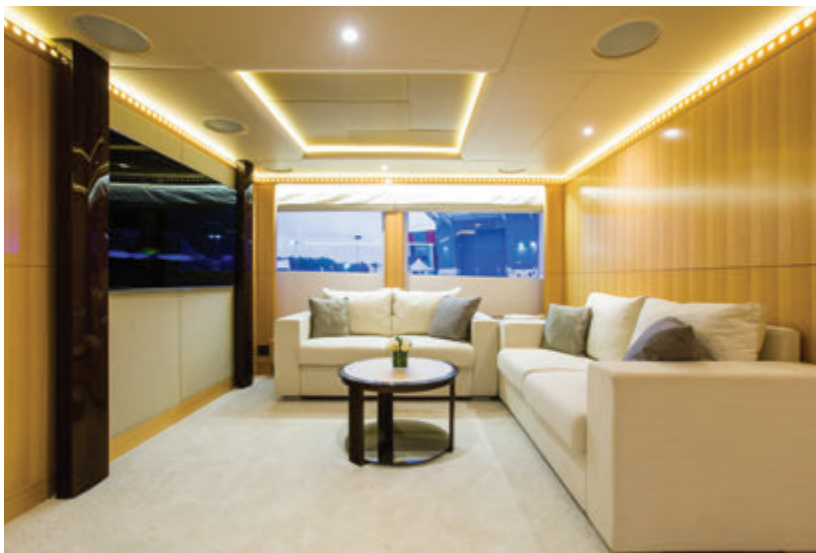
OPPOSITE Owner's Stateroom ABOVE CLOCKWISE Owner's Balcony. Owner's En Suite. Owner's Seating Area