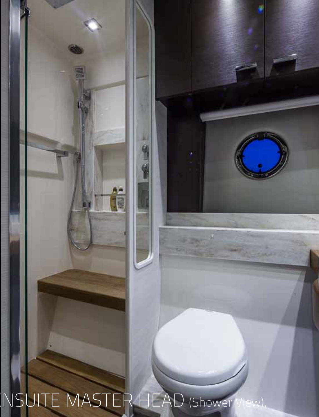
PRIVATE ENSUITE MASTER HEAD (Shower View).

The ensuite master head features a private entry from the master stateroom (full frame entry door), Teak countertop with solid surface accents, vessel sink, upper medicine cabinet with mirror, lower vanity storage, VacuFlush® toilet and opening porthlights (with privacy shades). Full fiberglass stall shower with glass shower door, Teak seat and waterfall shower head.