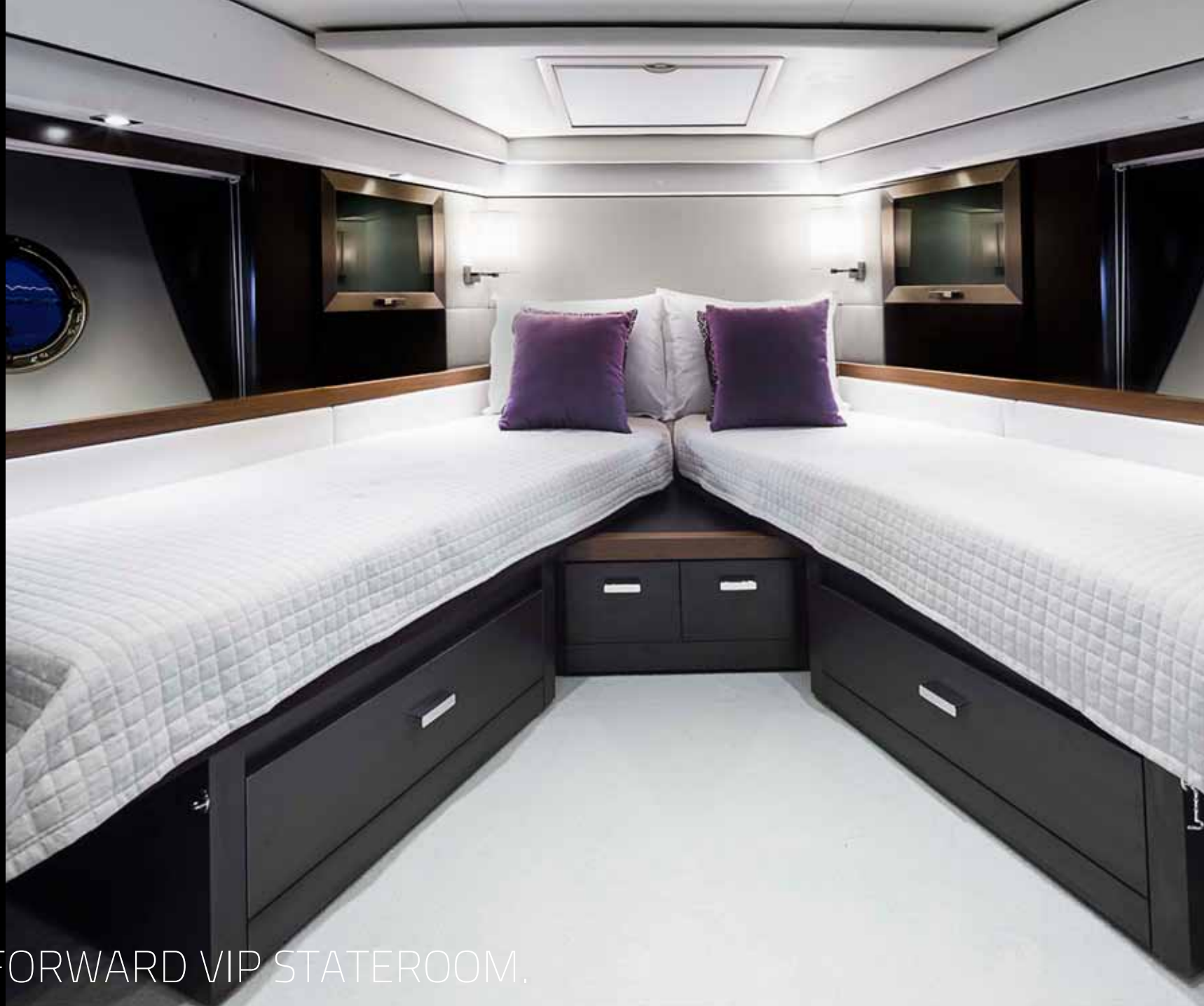
PRIVATE FORWARD VIP STATEROOM.

The VIP/guest stateroom has private entry to the VIP/day head, and features a queen pedestal berth with innerspring mattresses, upholstered headboard, box pillows, coverlets and underberth storage. The queen berth is also convertible to 2 twin berths. Bi-fold entry doors, upper hullside cabinets, starboard cedar-backed hanging locker, opening portlights (with privacy shades) and opening deck hatch. Marine Air Systems® 10,000 BTU air conditioning. Optional flat screen LCD TV and Blu-Ray DVD player, and Bose® Soundlink® portable bluetooth speaker system.