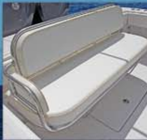
Optional Aft Seating