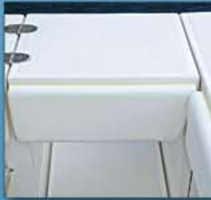
Swing & Lift Walk Thru Transom Doors