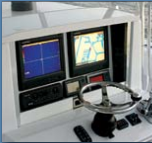
Custom Electronics Installations

More of Everything...the serious fishermen asked for!