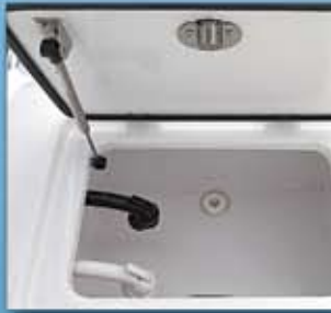
Fresh/Saltwater Bait Station & Sink