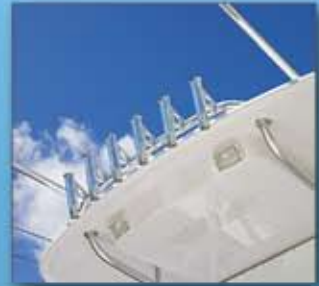
Premium Molded Hard Top