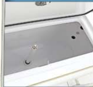
Oval Bait Well - 66 Gal. (250 Liters)