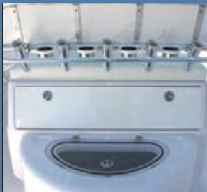
Rocket Launcher with Baitwell & Tackle