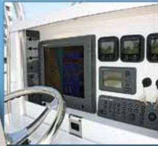
Lockable, Sliding Electronics Door