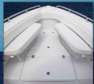
Optional Bow Seating