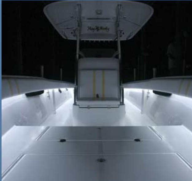
Indirect Gunwhale & Storage Box Lighting