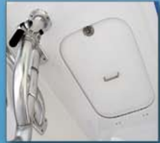
Hard Top Access Hatch and Ladder