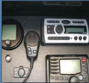
Hard Top- Overhead Radio Compartment