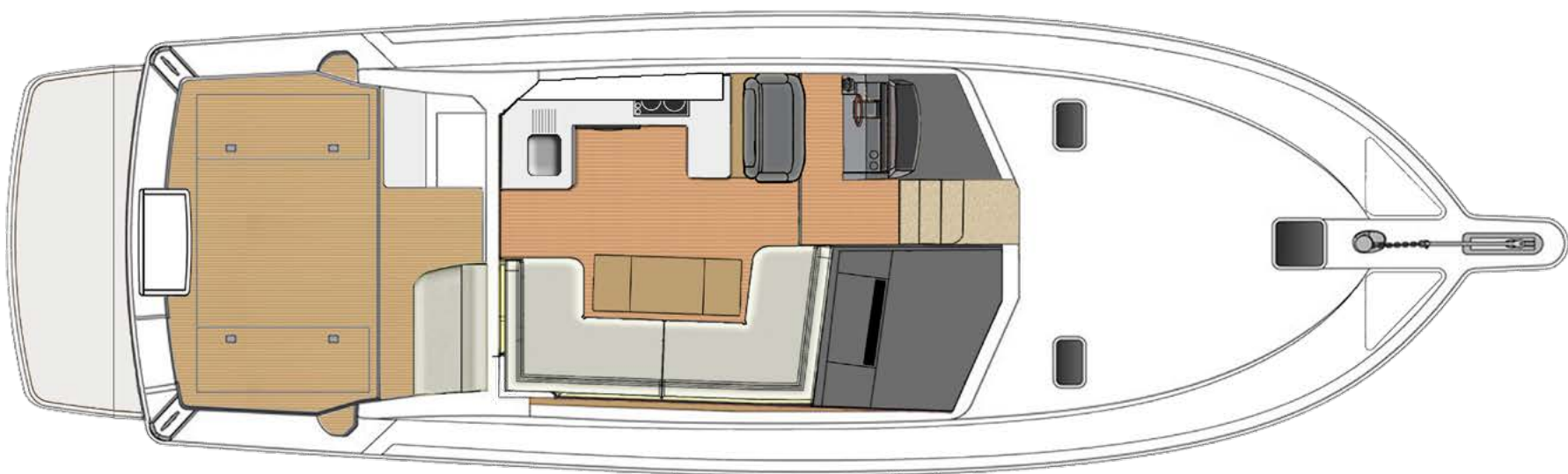
Optional barbeque and teak deck