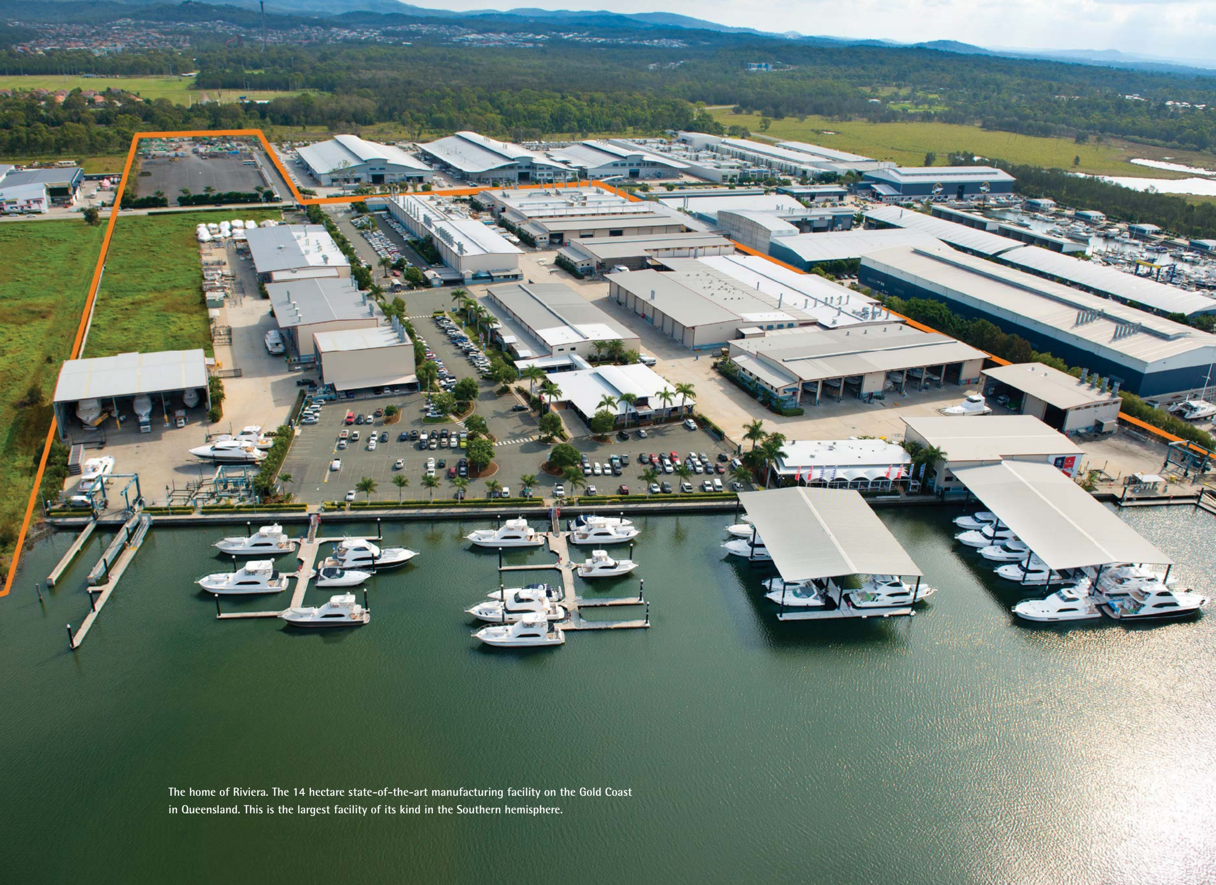
The home of Riviera. The 14 hectare state-of-the-art manufacturing facility on the Gold Coast in Queensland. This is the largest facility of its kind in the Southern hemisphere.